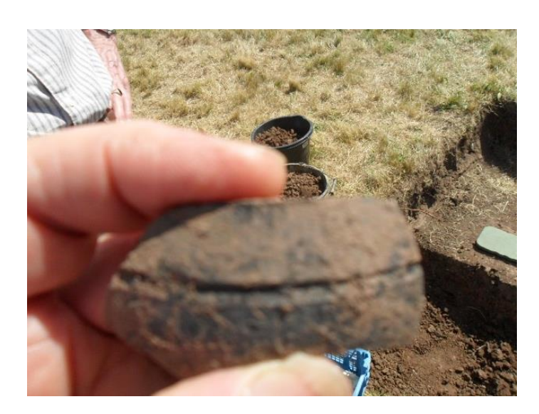
Potentially high-status Roman pottery

We will be assessing what we have found with the help of pottery identification specialists so as to flesh out the results. The town council has helped out with a grant to help fund the investigation and may host a small exhibition late in the year. Whatever happens, you will be able to read it all up on the BHTA website and future newsletters. It is already clear the site represents a significant part of Bingham's history and will repay further investigation in the future.