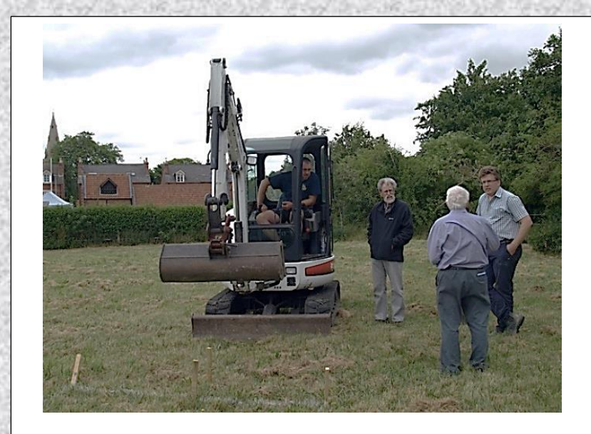
The dig gets underway

Five years ago, BHTA finished an archaeological investigation in Bingham which involved digging 57 one-metre square test in people's gardens. The results provided interesting insights into the development of Bingham town from prehistoric times to the present day.