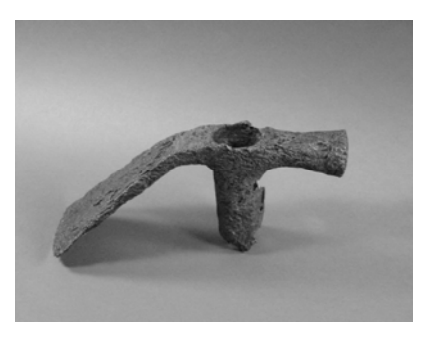
Margidunum artefacts A Roman iron adze, this would have had a wooden handle. √ 3<sup>rd</sup> century AD. bowl and lid bought from the Nene Valley.