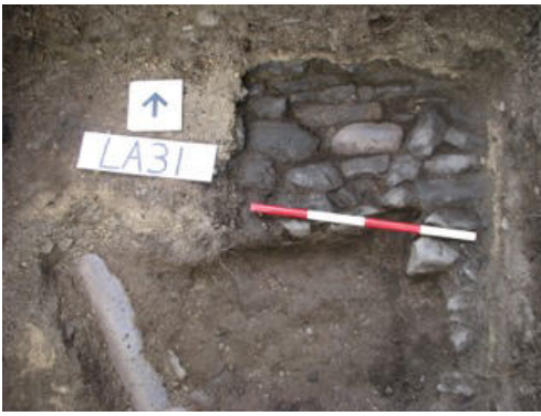
A cobbled yard that once was at the back of 19th century cottages on Long Acre that were demolished in the 1950s. A drain had been laid, cutting through the cobbles before the yard was covered in asphalt. The drain pipe is stamped John Knowles, Woodville, Derby. The company made drain pipes after 1871.

including Black Burnished Ware, which would have been expensive at the time and used only by a wealthy householder. Preliminary findings from the Long Acre pits, however, are puzzling.