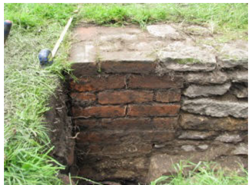
A buried wall found behind the Chesterfield Arms. It probably dates from the 19th century. It is mostly built with stone wall with bricks used only at the end. The purpose of the wall is not known (yet).

The Chesterfield pits yielded more or less what we expected with a good assemblage of medieval pottery and some rather nice bits of Roman pottery