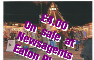
This year's calendar theme is "Bingham Celebrations". It can always be used at celebrations events, from Royal Anniversaries, to special occasions and local culture. We have brought together a range of photos and stories of these events, together with some old colour views of Bingham to relive the microcosmic nature of many historic celebrations.