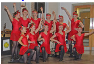
The girls of the Bingham School of Dance finish their 1920s tap dance routine.

demonstration of the Charleston and a 1920s tap routine by the Bingham School of Dance.