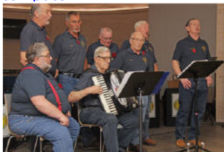
The Stormy Weather Boys in full flow during the Saturday evening concert.