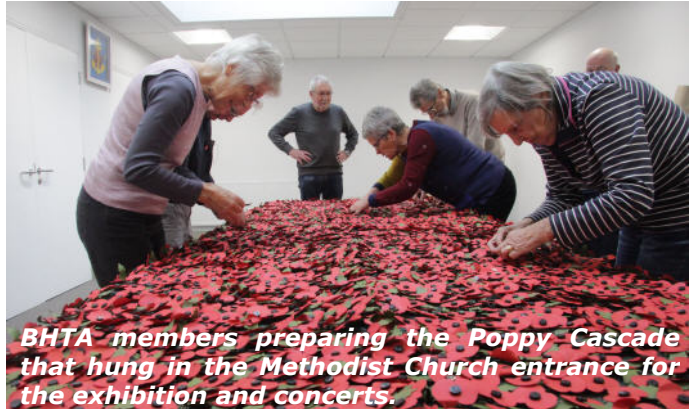
BHTA members preparing the Poppy Cascade that hung in the Methodist Church entrance for the exhibition and concerts.

Our web site contains the family histories of all those whose names were recorded in the bound Bingham Roll of Honour, kept by the parish church. We also researched the newspapers of the time, war diaries and other sources. A small number of families responded to our requests for information and particularly photographs. Our research provided the core of a two-day exhibition we staged in the Methodist Community Centre. The visitors' book included many complimentary comments! We also hosted two school visits from Year 6 pupils at Robert Miles Junior and Carnarvon Schools. We know of several visitors who returned for a second and even third viewing as there was much of interest to be absorbed.