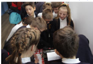
The fascination for children of a 1920s typewriter. 'Is it a computer?'