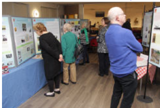
Central aisle of the exhibition with posters of the 'fallen' (L) and those that returned (R )