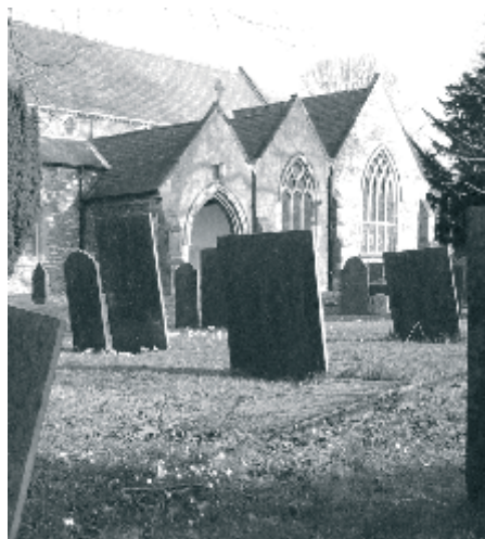
Bingham Parish Churchyard.