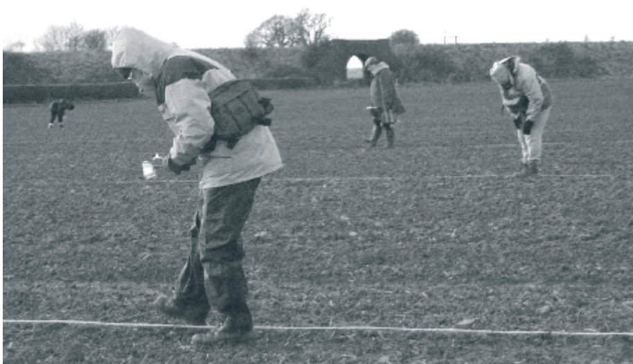
Field walking volunteers in action on Starnhill Farm

- bringing local history to light and life