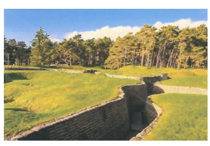
Trenches on the battlefield at Vimy Ridge - as they are today.

On the opening day of the Battle of Arras, 9 April 1917, the four divisions of the Canadian Corps, fighting side by side for the first time, scored a huge tactical victory in the capture of the 60 metre Vimv Ridae. hiah Sadly, Charles was killed in action at Vimy Ridge the next day when the Canadians took Hill 145 at the cost of 70 dead and many wounded. Having no known