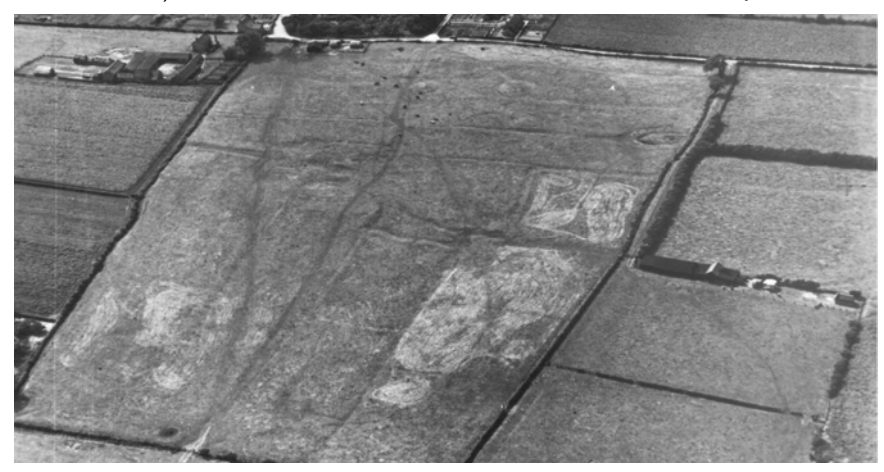
1949 Aerial view of Crow Close from the north-east

As both the Crow Close survey and the field-walking will be winter activities, our plan is to