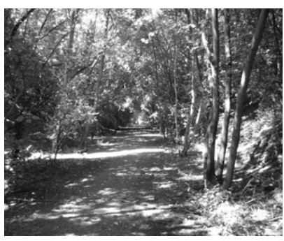
A walk in the Bingham Linear Park is just one of those to be featured in the forthcoming BHTA Trails leaflet.

highlight the routes, notable features, both man-made and natural, the terrain and, where appropriate, somewhere to get some refreshment. Later this year, when the leaflet is produced, it will be available, free of charge, from the Library, Court House and the Association.